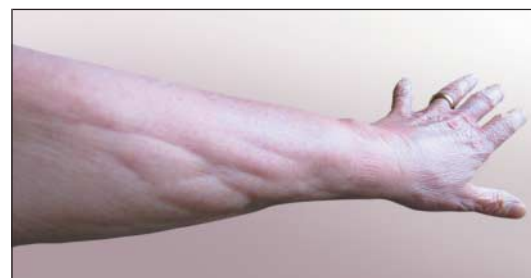
Left arm of the first woman showing puckering of the skin due to a sclerosed network of forearm veins

This complication had not previously been reported to the Committee on Safety of Medicines or the drug company, although the serious effects of extravasation of